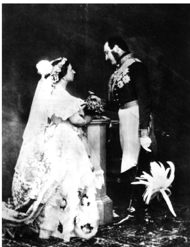
Married in 1840, Queen Victoria and Prince Albert re-posed their wedding vows for the daguerreotype camera in 1854.

The Daguerreotype, for twenty years the darling of America, received a much cooler welcome in Britain, at least in part because Louis Daguerre and his partner, Isadore Niépce had taken out a English patent on their process on 14 August 1839 1 , five days before it became freely available to the rest of the world. This of course flew in the face of the generous intention of the French Government when it granted pensions to Daguerre and Niépce in return for their invention, having done so on the understanding that the daguerreotype did not lend itself to being secured by a patent and thus was to be made freely available à tout le monde 2 .