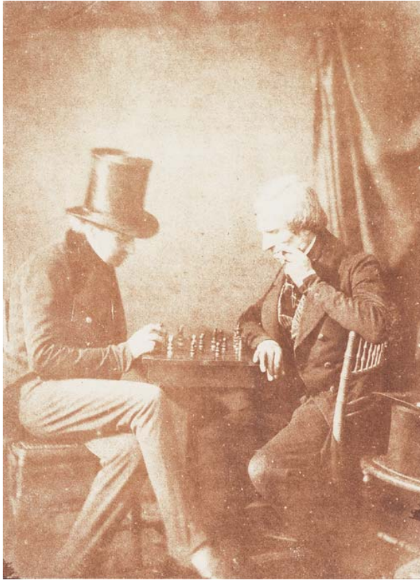
The Chessplayers, attributed to Claudet circa 1843 (salted paper print).

engravings would be based. The final engravings measured 91.5 x 127 cm (36 x 50 inches) and were published on 7 January 1843, one showing the view of London to the north of the Duke of York column in Pall Mall, from the top of which Claudet had taken his pictures, and the other to the south. From then on, The London Illustrated News relied heavily on daguerreotypes, particularly for portraits, for their illustrations.