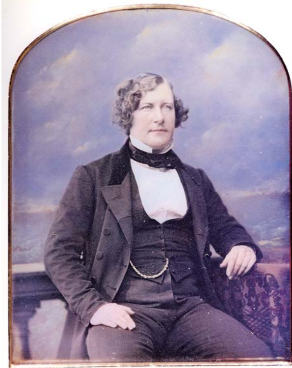
Richard Beard: A gentleman seated, 1849 (coloured daguerreotype)

could commission. It has been said that in those heady days, the Beard studio overlooking Cavendish Square made £150 a day although others say it more likely averaged £60 a day.