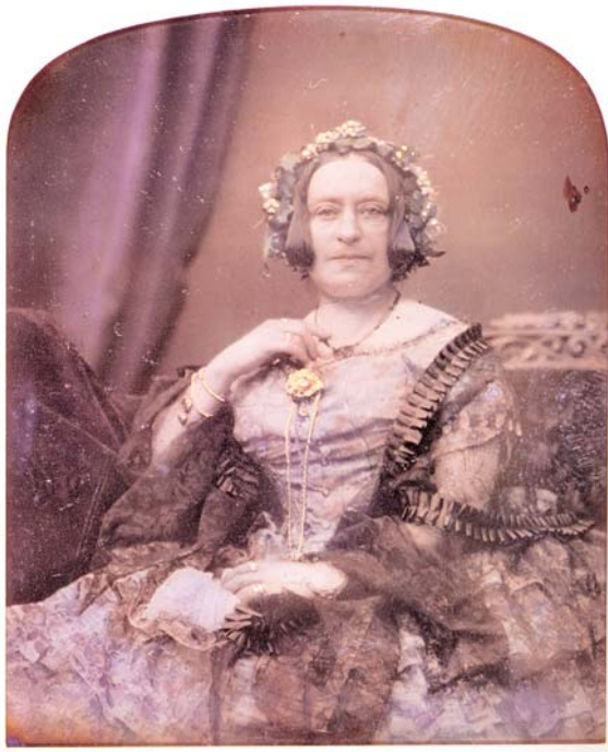
Antoine Claudet: portrait of a lady, c.1850