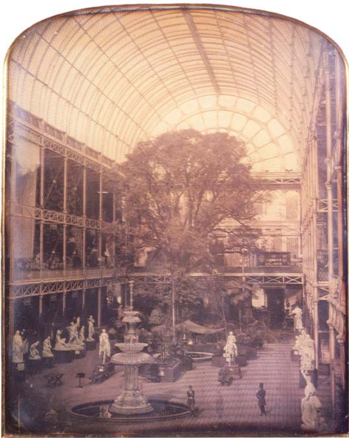
John Mayall, Crystal Palace 1851 daguerreotype 20.2 x 25.5cm.

Photography , of course, has the meaning of drawing or writing with light (from the Greek phos , light and graphis , a stylus or paint brush) and it has been this association with light which has fascinated public and scientist alike since long before Niépce and Daguerre made permanent images possible. Sometimes, and especially in the 19 th Century, this fascination has verged on religious awe, almost as though one's image was being drawn by the finger of God — or, more accurately, the Sun-God.