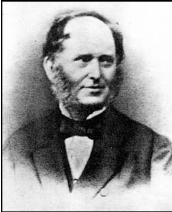
Richard Beard (1801-1885) 6

In March 1841, a former coal-merchant Richard Beard opened the first professional portrait studio in Great Britain where he used Wolcott's mirror camera to make daguerreotypes. Beard had paid the American inventor £200 plus his expenses for a one-half share in this rather strange camera which used a concave mirror rather than a lens to focus the image on the plate. Later he paid £7,000 for the other half, a decision he would live to regret because not only was the Wolcott camera limited physically to